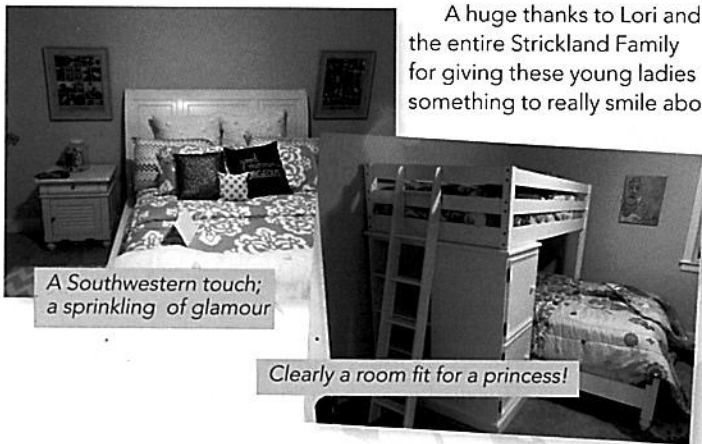
A Southwestern touch; a sprinkling of glamour

everyone who participated and supported this special tournament in and special thanks to Granddad for putting on a first class tournament.