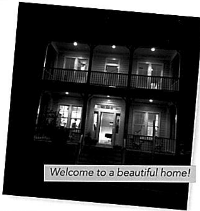
Welcome to a beautiful home!