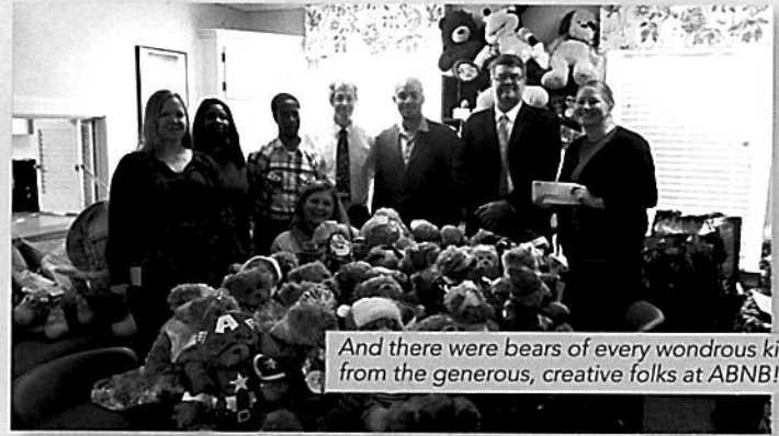
And there were bears of every wondrous kind from the generous, creative folks at ABNB!